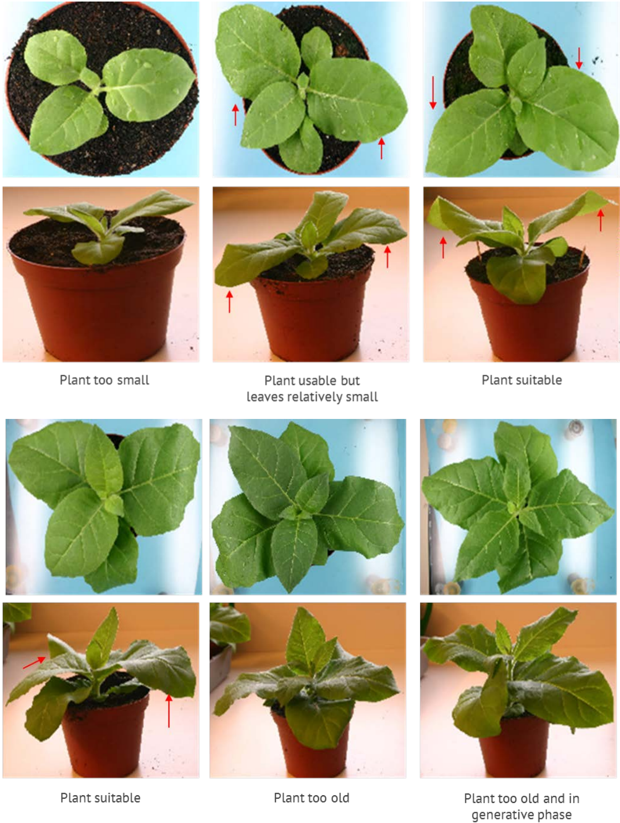
Figure 2. Overview of Nicotiana tabacum cv. Xanthi NN plants in different growth stages (two pictures taken per plant; pot diameter 14 cm)